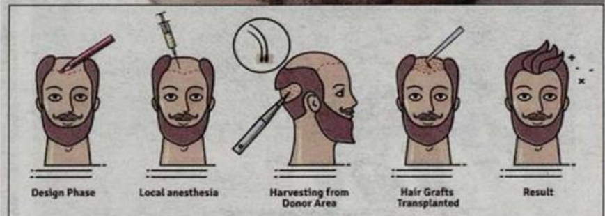
HAIR-RAISING: Irish men are looking for cheap hair transplant surgery options abroad